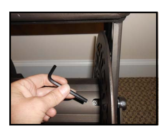
Step 7: When the reel is turned, the elbow will now be on the right side of the reel.

Step 6: Reel should now be easily removed from frame.