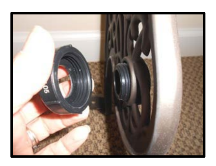
Hold the elbow stationary to unthread the swivel