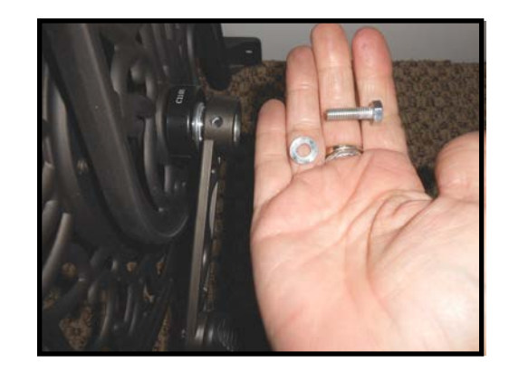
Step 5: Loosen black plastic locking ring and remove shaft to crank handle.

Step 6: Reel should now be easily removed from frame.