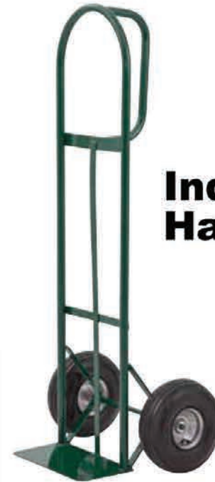
Industrial Hand Trucks