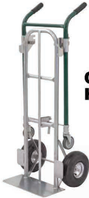
Convertible Hand Trucks

Liberty Industrial offers a wide and growing array of hard working products including Hand Trucks, Folding Utility/Luggage Hand Trucks and Hose Reels/Carts.